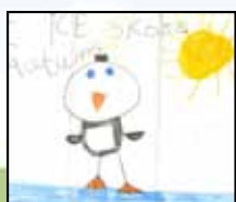
Autum, (age 6) Oahe FCU Pierre, SD